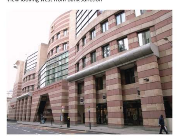
View looking east from Poultry