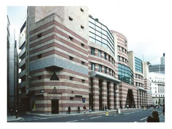
View looking east from Queen Victoria Street